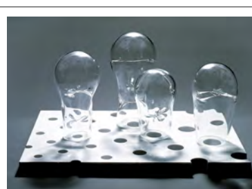
Recent work Inner Structure: Strings 4 | 1996 | Galss, marble Collection of The Museum of Modern Art, Wakayama

*During the exhibition period, part of the exhibited works is scheduled to change. We will make an announcement regarding this on our website at www.artcourtgallery.com